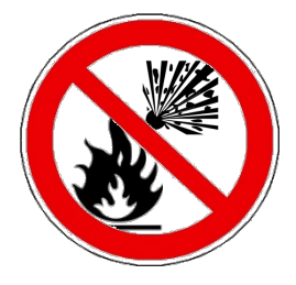
No incendiary devices and explosives